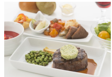
Examples of Business Class menus. Images might not reflect the current meals served on board as menus change regularly.